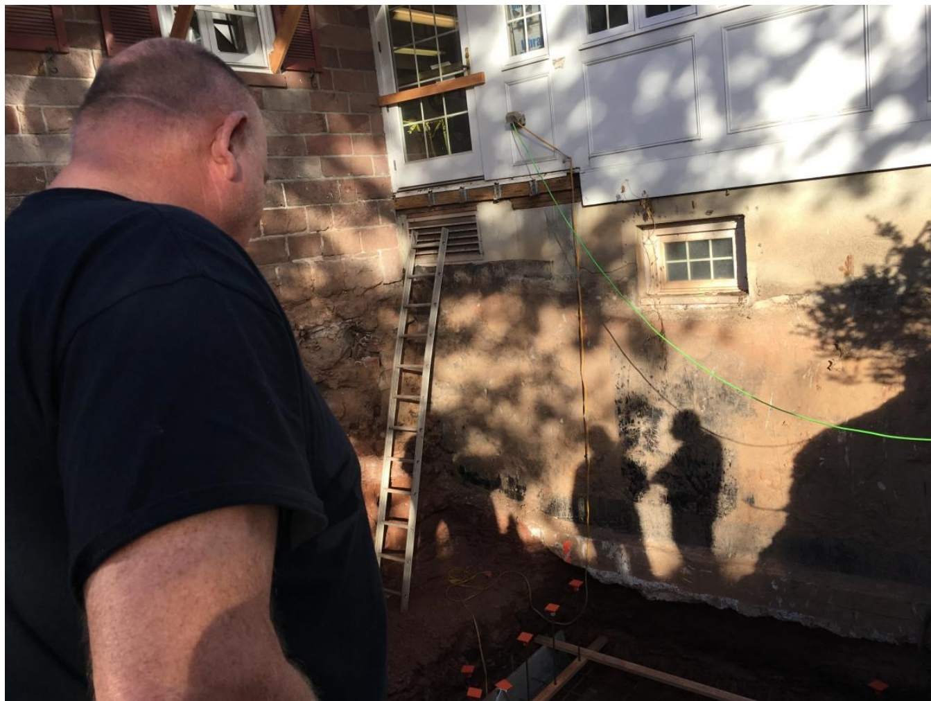
Shadowy meeting of contractors and architect during renovations at the Blauvelt Free Library

Share a library-related photo, include a brief caption, your name, position and the library's name. A photo release is required from recognizable individuals in the photo. Click here for the RCLS photo release. Submit the picture to rclsmemo@rcls.org with 'Photo of the Week' in the subject line.